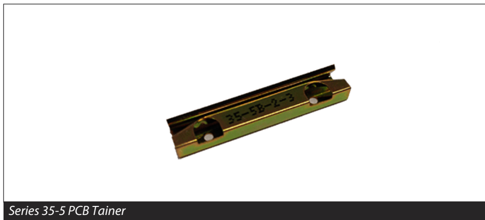
Series 35-5 PCB Tainer